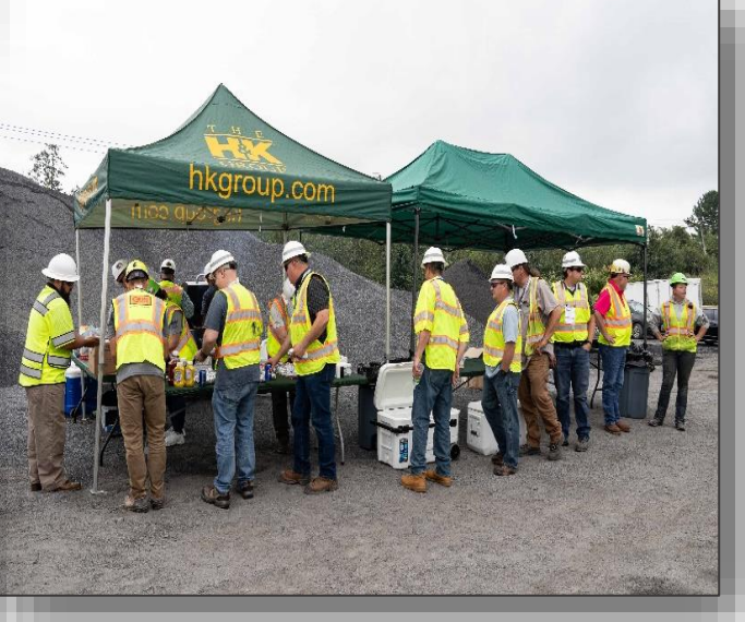
We Are H&K!