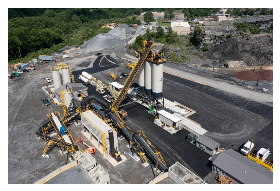
Easton Asphalt's fully redesigned plant entrance and exit pattern is emphasized in this photograph. Customers should expect smooth and efficient product pick-up at H&K's newest and most efficient asphalt plant.