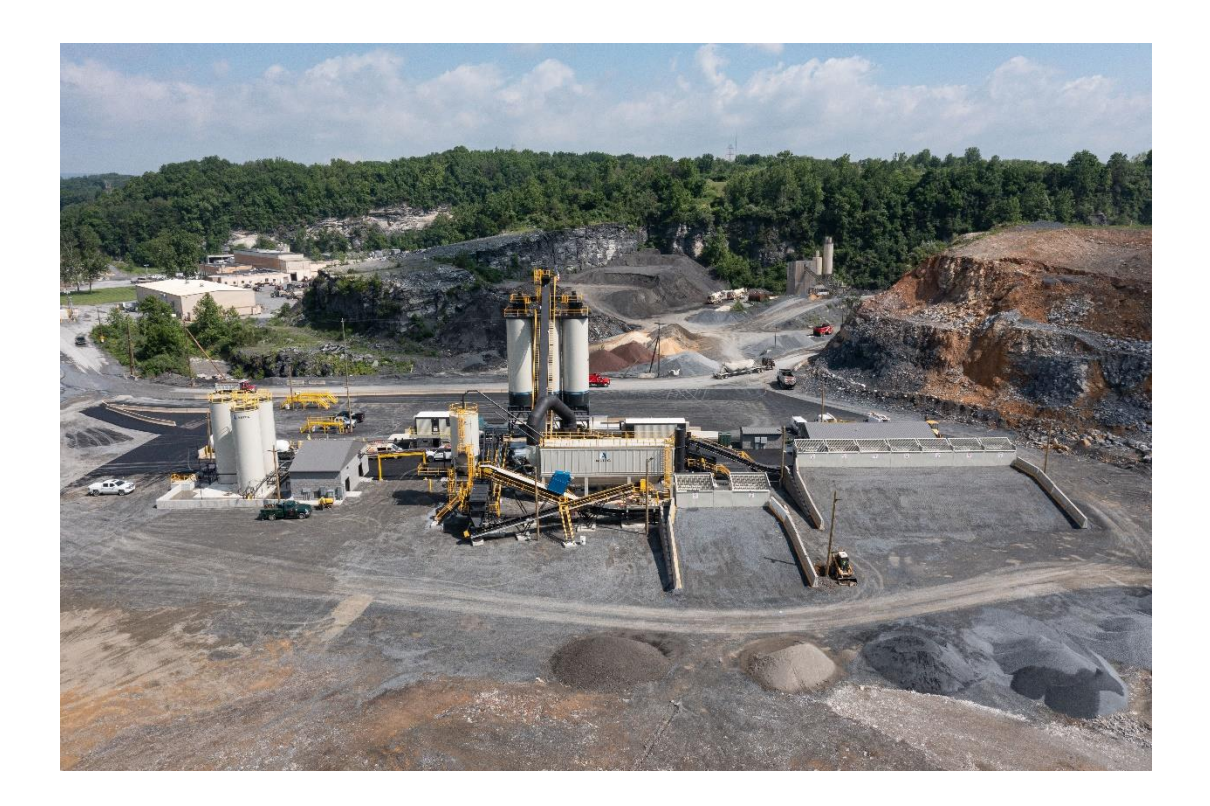
H&K's brand-new Easton Asphalt plant is prepped and ready for production in this late June 2022 aerial drone photograph!