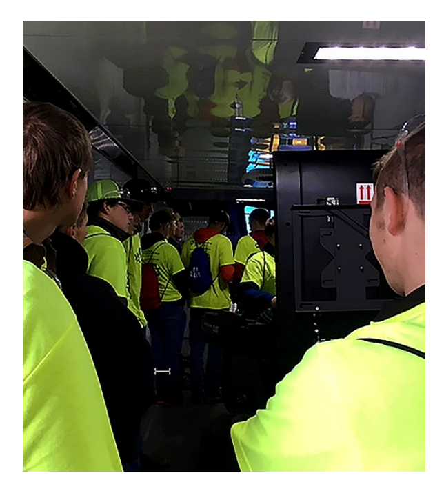
Students\ attending\ the\ Pennsylvania\ College\ of\ Technology's\ "Build\ My\ Future"\ eagerly\ await\ their\ turn\ on\ the\ simulator.