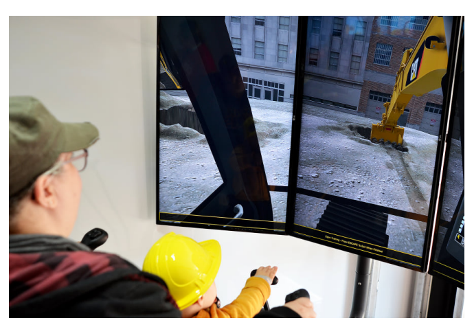
Residents\ of\ all\ ages\ had\ the\ pleasure\ of\ virtually\ experiencing\ heavy\ equipment\ operation.