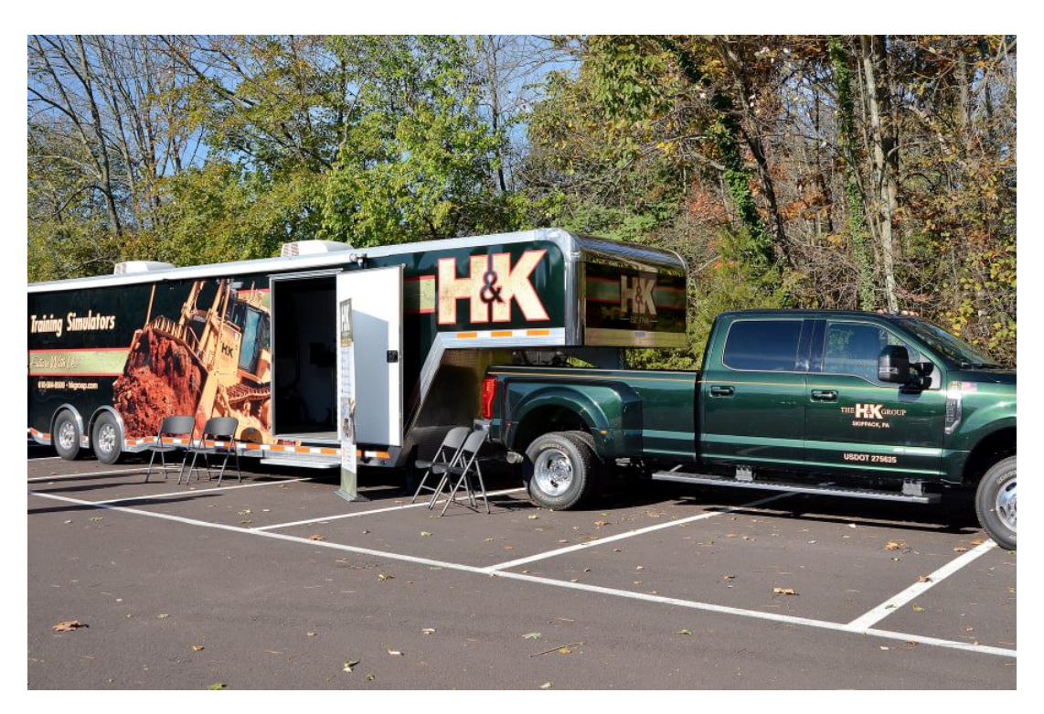
The\ exterior\ of\ H\&K's\ mobile\ Caterpillar\ (CAT)\ heavy\ equipment\ simulators,\ complete\ with\ full\ "H\&K"\ branding.